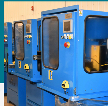
2100 Series Up to 0.75" Ø end finishing Electric and hydraulic